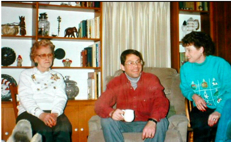
Christmas holiday circa 1990

Like most families, milk and cereal was the school day breakfast. The weekend was when there was time to cook. The sound of the old fashioned coffee percolator's bubbling gurgle was a pleasant sound to wake up to. In the 1960's and 70's, the classic weekend family breakfast was eggs and toast with perhaps the a half of grapefruit on the side. Bacon was only occasional but became common with my generation.